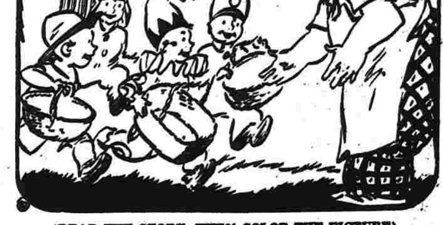
(READ THE STORY, THEN COLOR THE PICTURE)

Real Estate Insurance Steamship Tickets 1009 MAIN STREET