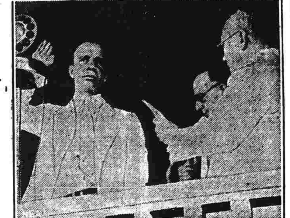
Solemnly, with hand upraised, Theodore Roosevelt—bearer of a name famed in American history—was being sworn in as Governor of the Philippine Islands when this picture was taken at ceremonies in Manila. The oath was administered by the Chief Justice of the Philippines.